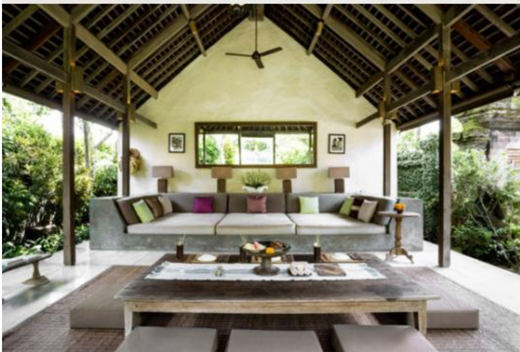
The living room – yes, really – at Villa Belong Dua. Photo: Supplied

Link : https://thenewdaily.com.au/life/travel/2019/08/09/luxury-holiday-rentals/