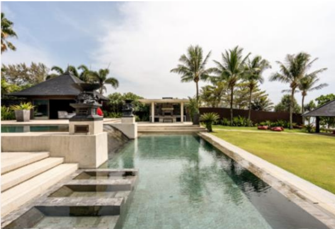
Paradise (not) in Phuket: Villa Saanti.